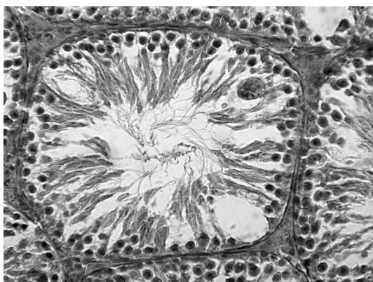
Figure 2. Presence of cell-free regions ("windows"), observed in group of animals treated with 2000 mg/kg of pyrazinamide during whole period of spermatogenesis. Hematoxylin and eosin, 400×

(+22,5%), histidine (+79,2%), arginine (+28,0%), threonine (+46,6%), glutamic acid (+22,0%), isoleucine (+42,2%) and phenylalanine (+68,0%). For the majority of amino acids contents pyrazinamide effects were dose-dependent.